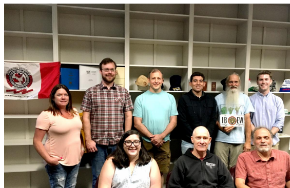
Members of Working Systems Cooperative